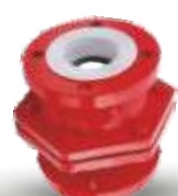
Check Valve - NRV