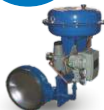
Butterfly Control Valve