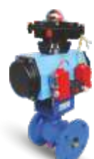
Jacketed Ball Control Valve