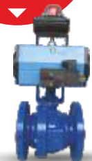
Pneumatic Ball Valve