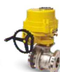
Electrical Actuated Ball Valve