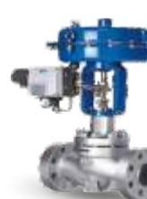
Globe Control Valve