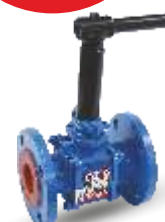
Extended Stem Ball Valve