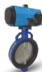
Pneumatic Butterfly Valve