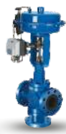
3 Way Globe Control Valve