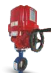
Electrical Actuated Butterfly Valve