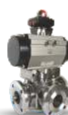
Pneumatic 3 Way Valve