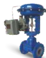
Diaphragm Control Valve