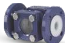
Sight Flow Indicator