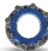
Flange Mounted Sight Glass