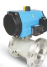
Pneumatic Jacketed Ball Valve